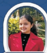
AKANKSHA B. PHARMACY